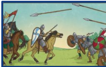
Battle of Hastings