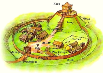
Motte and Bailey Castle