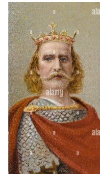
Harold Earl of Wessex