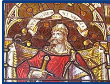
Hardrada, King of Norway