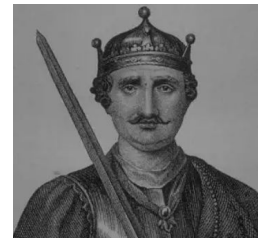
William the Conqueror